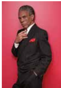
Andre De Shields